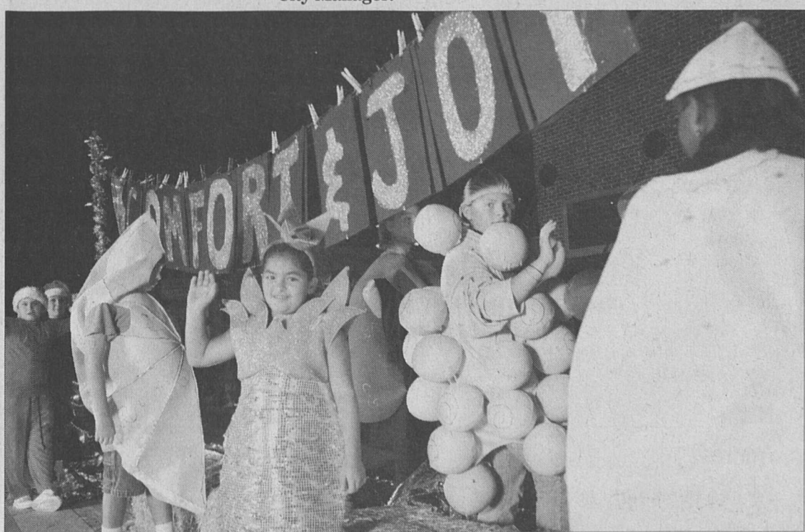
The Golden Goose won best overall float in this year's Chamber of Commerce Christmas Parade with its Fruit of The Loom theme.

Kick off your New Years Eve celebration at the Eagle Lake Fireworks Display Monday, December 31 at 6:30 p.m. on Calhoun Road. For more information call 979-232-0233.